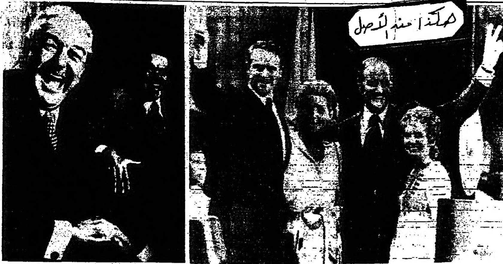
Former U.S. Treasury Secretary John Connally shared a joke with President Nixon Friday at the Western White House in San Clemente, California, and later told newsmen he would support the President for re-election. Connally, a Democrat, has been mentioned as a possible running mate for Mr. Nixon in the November election. At right, Sen. George McGovern and his running-mate, Sen. Thomas F. Eagleton, flanked by their respective wives, Eleanor and Barbara Ann, waved to the closing session of the Democratic Convention.